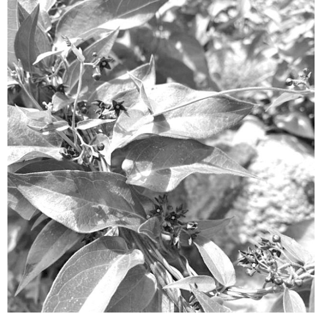
Close up of an established plant with many vines